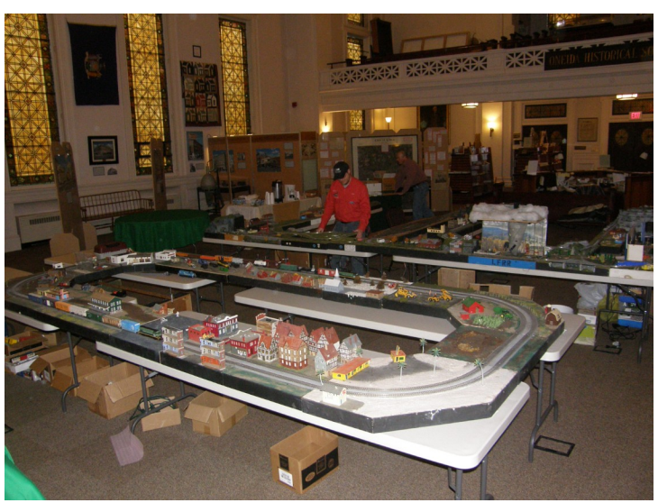
Oneida County History Center December 2014